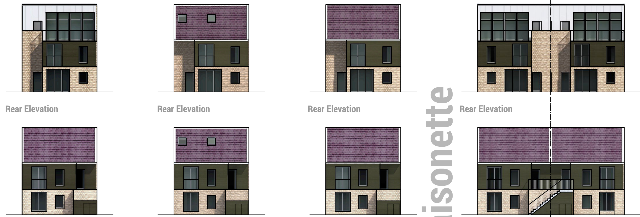
Rear Elevation Front Elevation Rear Elevation Front Elevation Rear Elevation Front Elevation Rear Elevation Front Elevation